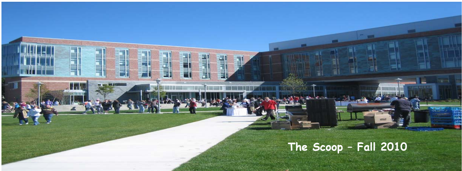
The Scoop - Fall 2010

The Fall Semester of 2010 saw the Grand Opening of the Marsh Hall Dining Hall and Conference Center. The new dining facility has brought an exciting new dimension to dining to the Salem State campus. The new hall has many new features such as Woodstone fired pizza oven, Menutainment sauté station featuring stir-fry cooked to order, gnocchi sautés, and omelets made to order, and an expanded salad bar. Also located with the residence hall is our Outtakes convenience store. Open seven days a week Outtakes offers everything a student could need for their dorm room. From bottled beverages, to prepared sandwiches and salads, to fresh and frozen entrees, to various snacks and sundries the students have many enticing items to choose from.